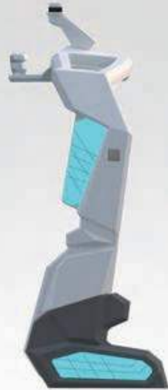
FLIGHT CONTROL TOWER MANUAL OR ACTUATED

Available on: G25 | G23 | G21 S25 | S23 | S21