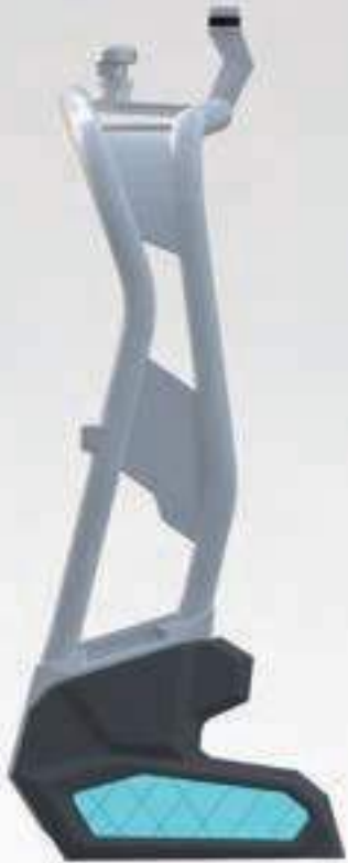
FLIGHT CONTROL TOWER MANUAL