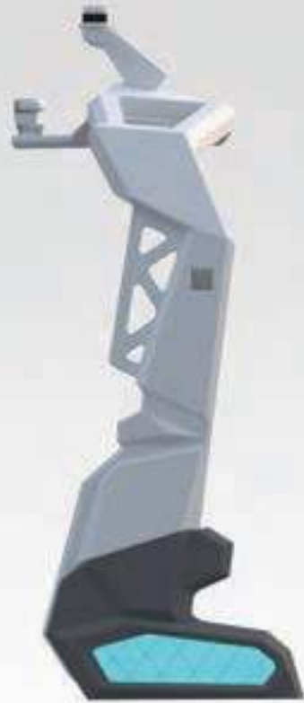
FLIGHT CONTROL TOWER ACTUATED