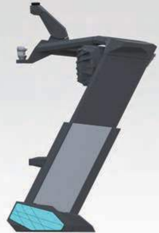
FLIGHT CONTROL TOWER TELESCOPING

Available on: G25 | G23 | G21 S25 | S23 | S21